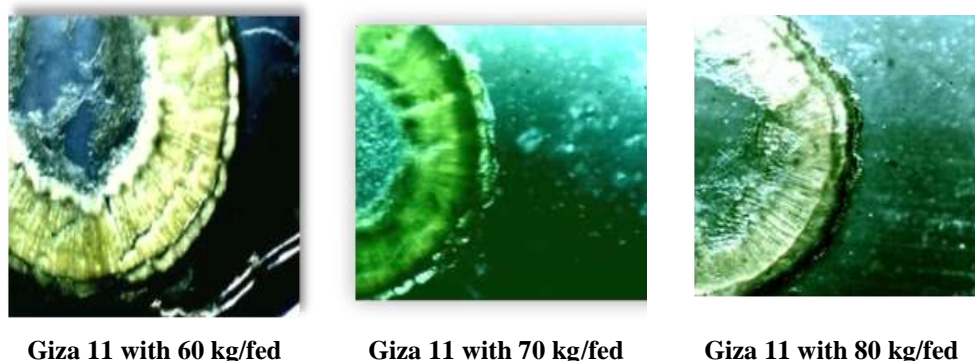
Fig. 1. Cross section of Giza 11 cultivar as affected by seeding rates.

characteristics (El-Shimy et al 2020). The present findings are similar with those recorded by Zuk et al (2015) and Nag et al (2019).